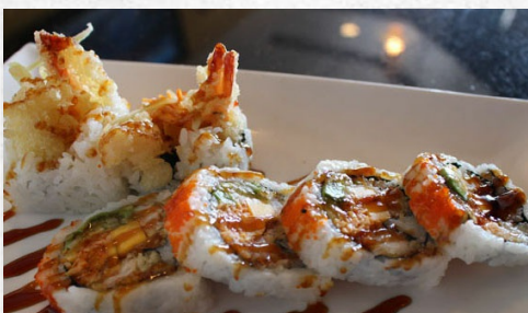
Mango Tango Roll

spicy tuna, spicy salmon, avocado, crab stick wrapped inside, then deep fried served with 3 kinds of tobiko