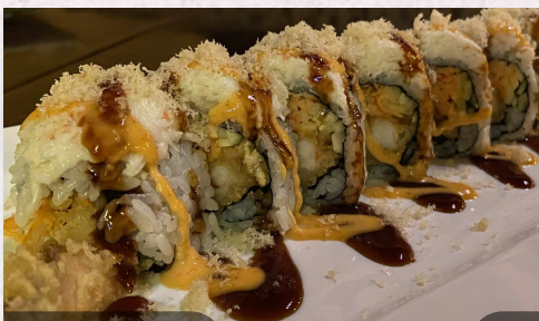
Snow Crunch 15

snowcrab, spicy kani, mango, cucumber topped with avocado drizzled with sweet plum sauce