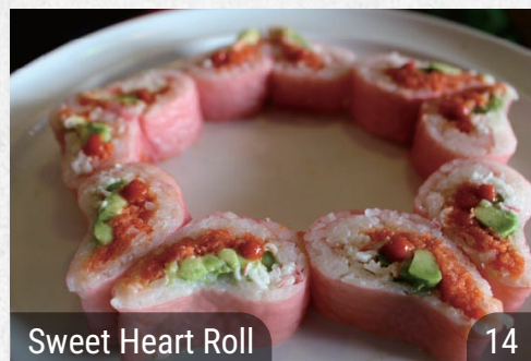
Sweet Heart Roll

deep fried jalapeño stuffed with avocado, cream cheese & snow crab, topped with tobiko, eel sauce & chili sauce