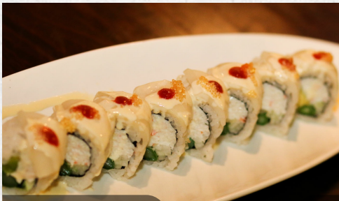
Snow White Roll 15

salmon, avocado, cucumber, & cream cheese inside, spicy tuna, & spicy crab on the outside, topped with wasabi & eel sauce