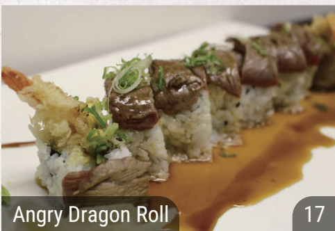
Angry Dragon Roll

fried crabstick, cream cheese & snow crab, topped with avocado, steamed shrimp & chef's special sauce