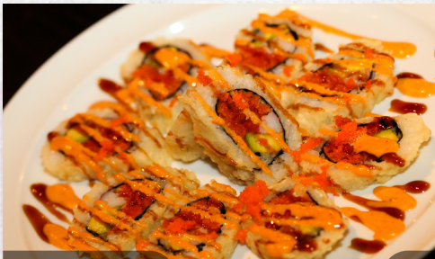
Samurai Roll 13

double seaweed, spicy tuna, snow crab, lettuce, cucumber, avocado, & cream cheese drizzled with spicy mayo, eel sauce, and sriracha sauce