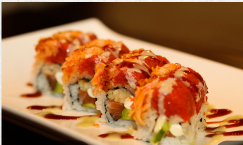
Jeremy Roll 15

shrimp tempura, avocado, cucumber, jalapeño, & crawfish, wrapped in soy paper and topped with our chef's special sauce