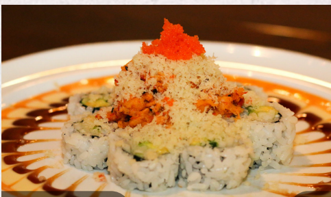
Volcano Roll 15

deep fried roll with salmon, white fish, crab meat, & cream cheese inside, topped with crunch, spicy tuna, and our chef's sweet special red sauce