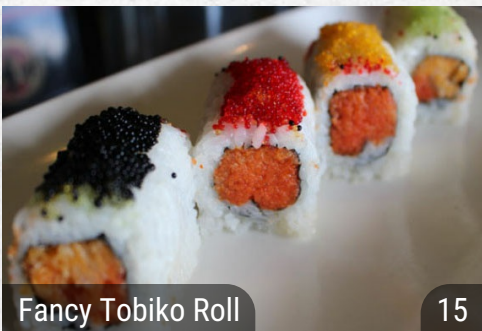
Fancy Tobiko Roll