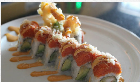
Tuna Lover's Roll

deep fried with seaweed wrapped inside, topped with spicy tuna & chef special sauce