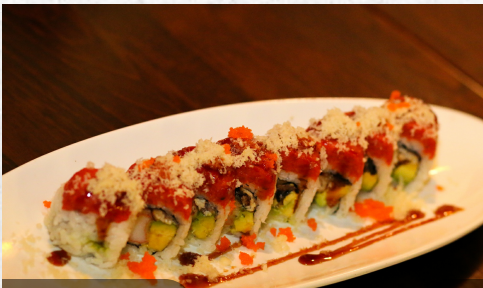
Mexican Roll 15

snow crab, avocado, cucumber, & asparagus inside, topped with white tuna and tobiko with a chef special sauce