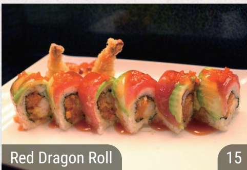
Red Dragon Roll

crispy shrimp tempura, cucumber, avocado, asparagus & spicy crab salad, topped with sliced beef with yuzu teriyaki sauce