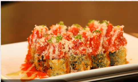
Central Park Roll 18

deep fried roll with spicy tuna, crab stick, & avocado inside, topped with tobiko & drizzled with spicy mayo & eel sauce