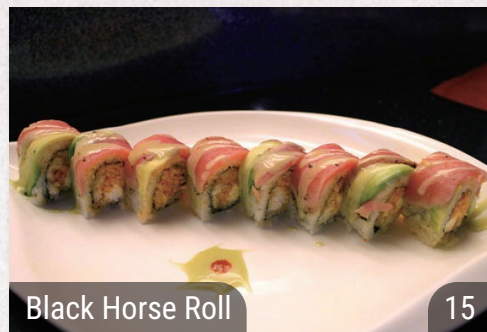
Black Horse Roll

shrimp tempura & spicy salmon wrapped in soy paper, topped with avocado, red tuna & a chef's special sauce