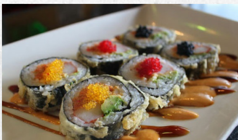
Kobe House Roll