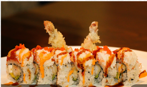
Field Goal Roll 15

shrimp tempura, spicy tuna, & mango inside, topped with crab salad, lobster salad, black tobiko, & drizzled in our chef's special sauce