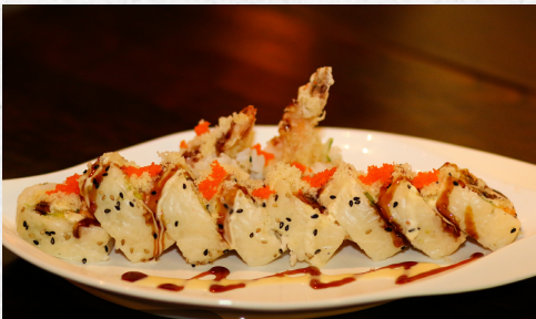
Louisiana Roll 16

shrimp tempura, avocado, cucumber, jalapeño, & crawfish, wrapped in soy paper and topped with our chef's special sauce