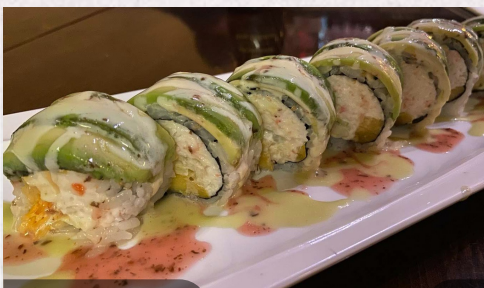
Green Dragon 15

crabstick, avocado, cucumber, & cream cheese inside, topped with spicy crawfish salad & crunch