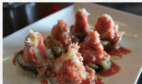
Crispy Spicy Tuna Roll

avocado, mango, shrimp tempura, cucumber, spicy kani inside, topped with red tobiko