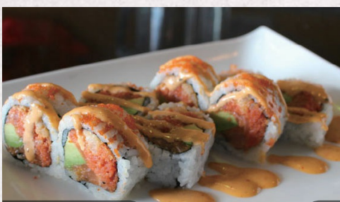
Spice Girl Roll

peppered tuna, tempura crunches, asparagus, radish sprouts, salmon, eel, avocado & spicy mayo on top