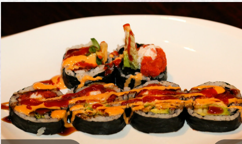
Bobby Roll 12

shrimp tempura, spicy tuna, & cream cheese inside, topped with spicy tuna, crab meat, and tobiko