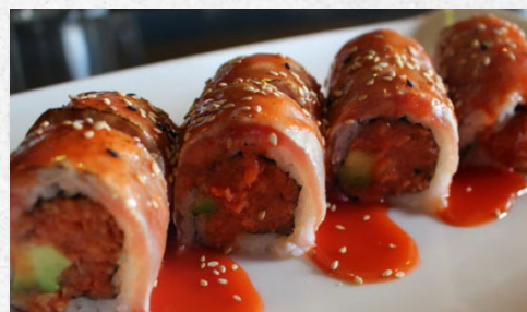
Sesame Tuna Roll

spicy crunchy tuna inside & topped with eel, avocado, shrimp & tobiko, served with wasabi sauce