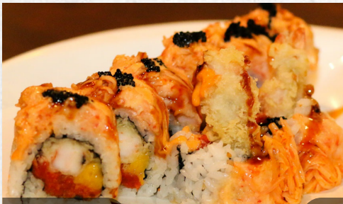
Empire Roll 17

deep fried crabmeat, eel, and avocado inside, topped with spicy tuna, tobiko, crunch, drizzled in eel sauce & sriracha sauce